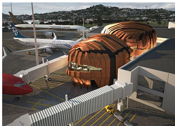
Artist's impression of the Rock