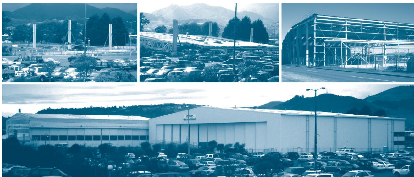
The new hangar at Nelson Airport

The additional hangar space has allowed for the relocation of heavy maintenance for Mt Cook Airline's ATR fleet to Nelson which is great news for Air Nelson, Nelson Airport Ltd and the region. The ATR maintenance will bring 30 new jobs to the engineering facility.